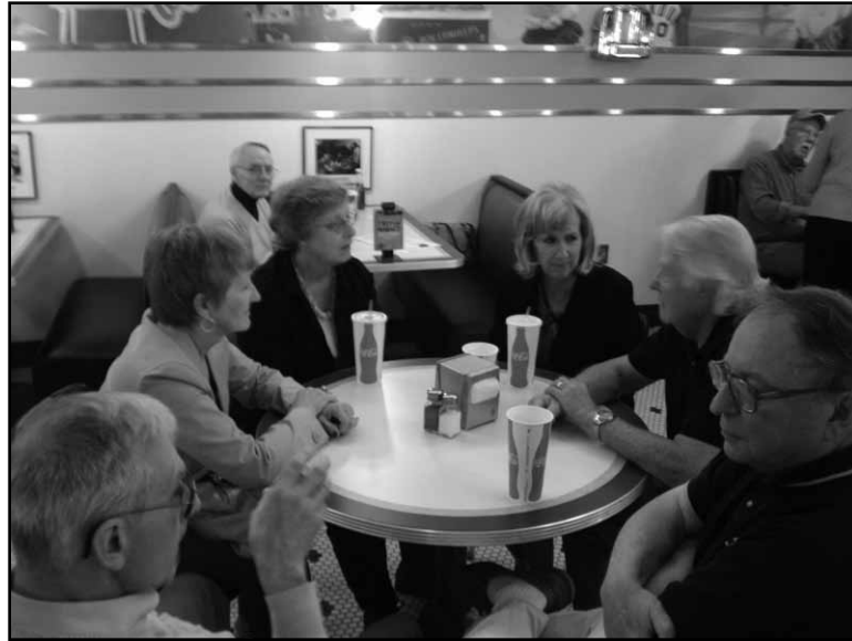
PURA members and their guests enjoyed an evening at Pappy's last spring.